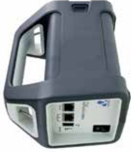
Veracity® PointSource Plus