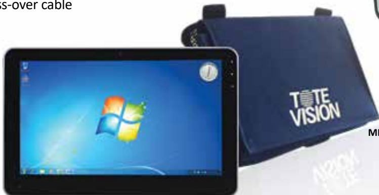
MD-1001 with totebag