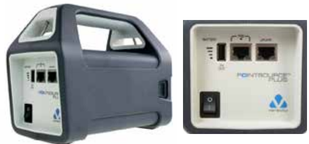
Veracity® PointSource™ Plus